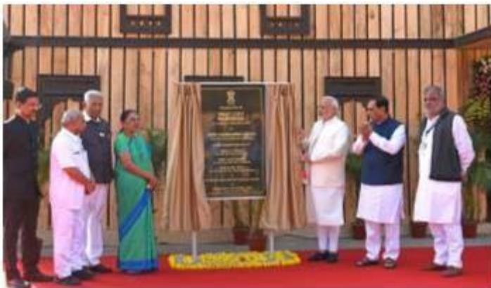
Inauguration of Tent City Narmada by Shri Narendra Modi, Hon'ble Prime Minister of India